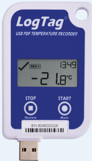
Rated Absolute Accuracy